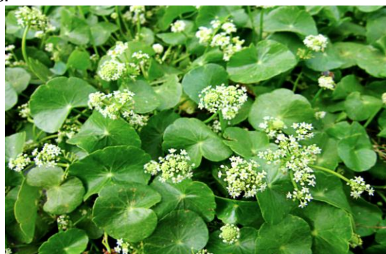
Fig.2. Centella asiatica (Flowers)

Stem is glabrous, striated, rooting at the nodes. Centella asiatica flourishes extensively in shady, marshy, damp and wet places such as paddy fields, river banks forming a dense green carpet. The leaves , 1-3 from each node of stems, long petioles, 2- 6cm long and 1.5-5cm wide, orbicular-renniform, sheathing leaf base, crenate margins, glabrous on both sides.