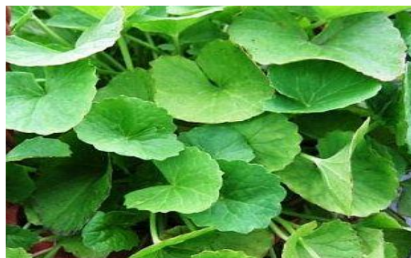
Fig.1. Centella asiatica

Centella asiatica found throughout tropical and sub tropical regions of India up to an altitude of 600m. The plant has been reported to occur also at high altitudes of 1550m in Sikkim and 1200m in Mount Abu (Rajasthan). It is found in most tropical and subtropical countries growing in swampy areas, including parts of India, Pakistan, Sri Lanka, Madagascar, and South Africa and South pacific and Eastern Europe. Centella asiatica (L.) is a prostrate, faintly aromatic, stoloniferous, perennial, creeper herb, attains height up to 15 c.m. (6-inches).